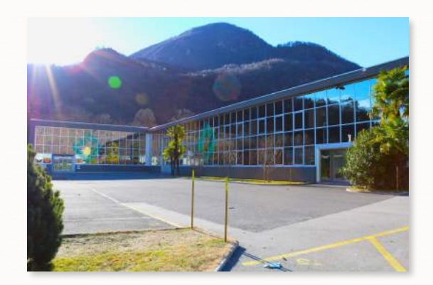
Newly built infrastructure with a state-of-the-art construction design and high security.

The Club Garage Svizzera is a project for storage of members' supercars, located within a structure that guarantees a high level of safety. All rooms are temperature controlled on a total area of 500 square meters. Another 100 square meters are used as a workshop for all design and interior and exterior customization of cars and other exclusive services. The high standing Lounge allows members to enjoy relaxation and drinks 24h/24h. All interior and exterior fittings of the buildings are made in every detail.